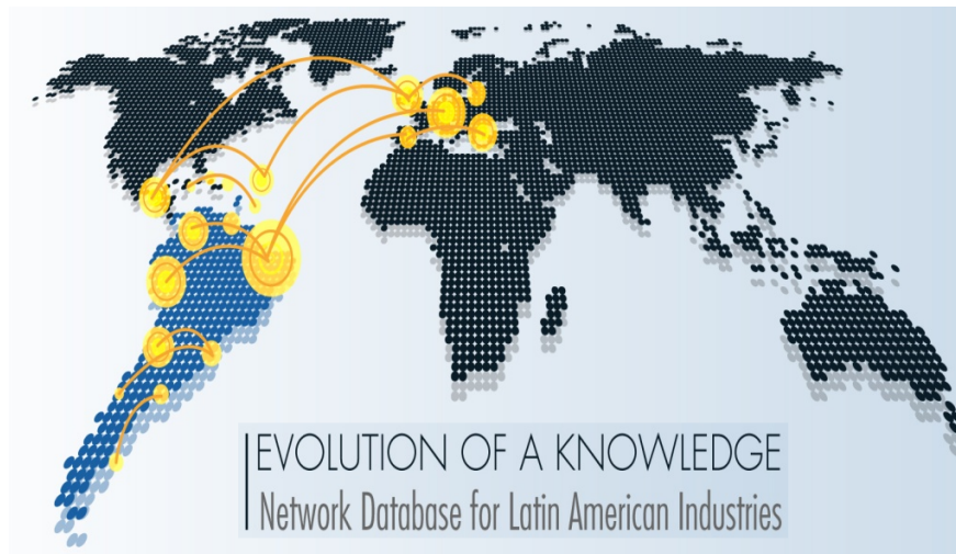
FIG. 1 The IKB is an innovative cooperation mechanism that promotes the exchange of knowledge and experience for the industrial and productive development of Latin American and Caribbean countries.